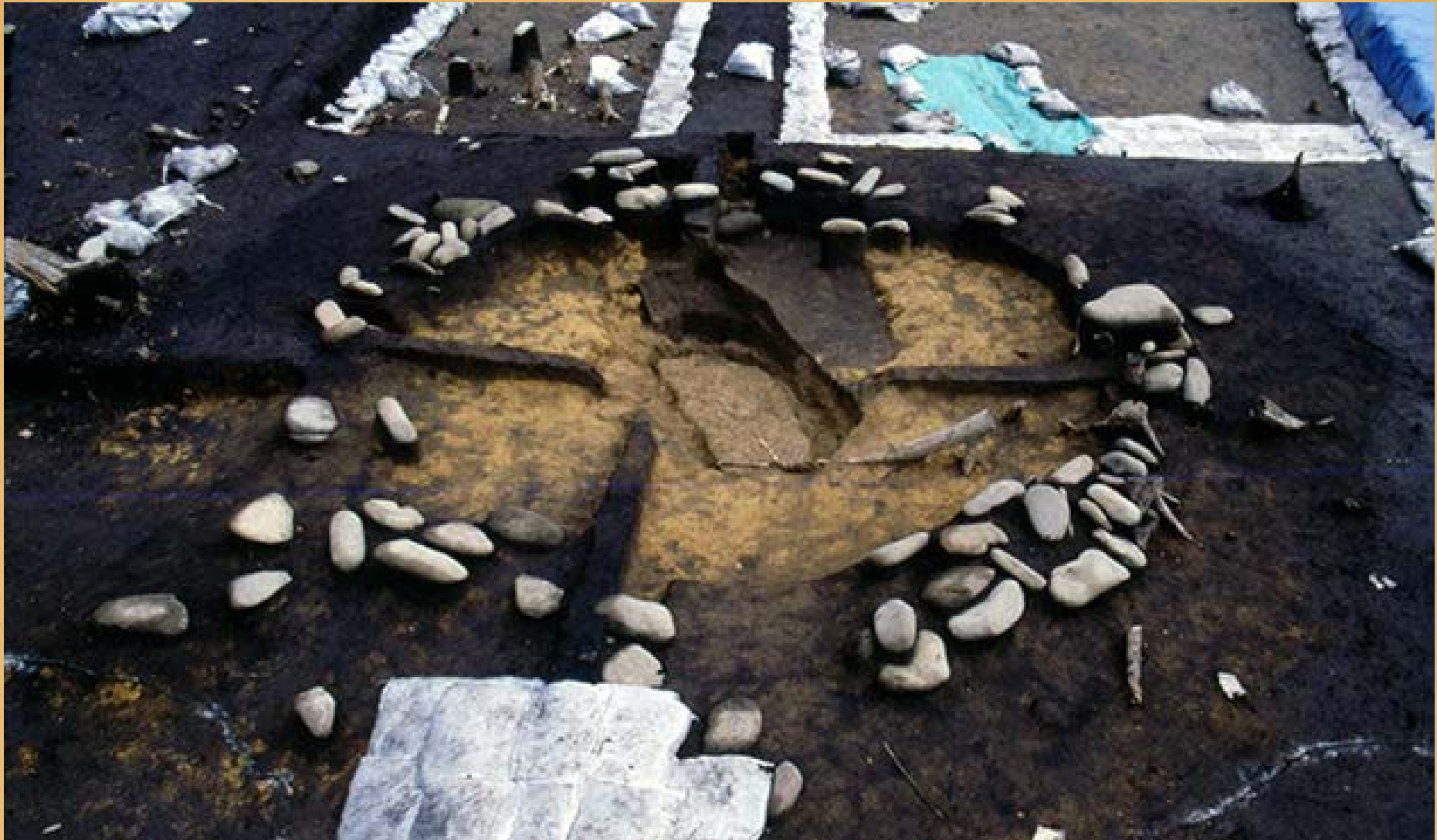
Stone Circles with Burials (at the time of excavation) from Sannai-Maruyama

http://sannaimaruyama.pref.aomori.jp/english/burial-area.html