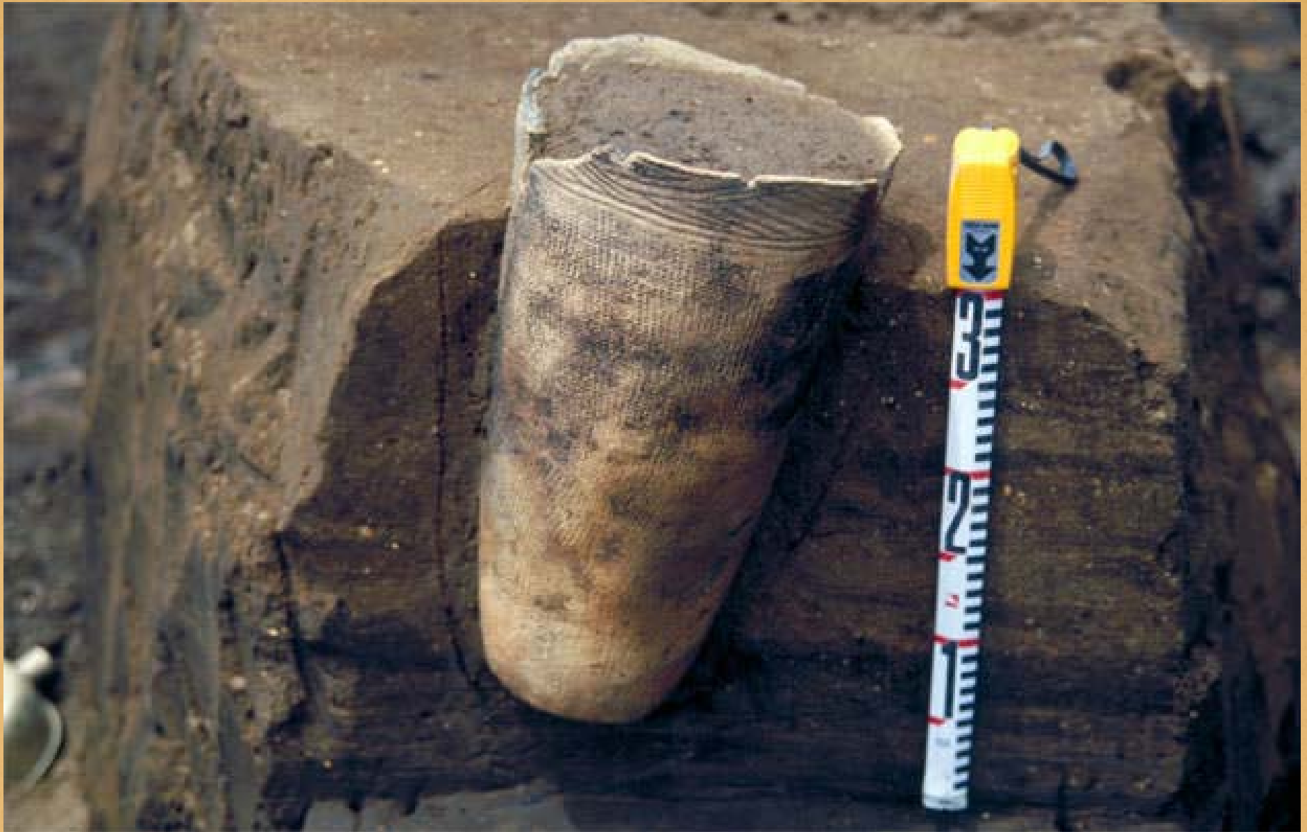
Burial jar for children from Sannai-Maruyama

From: http://sannaimaruyama.pref.aomori.jp/english/burial-pits.html