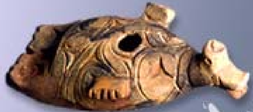
Chitose City's Bibi 4 Site