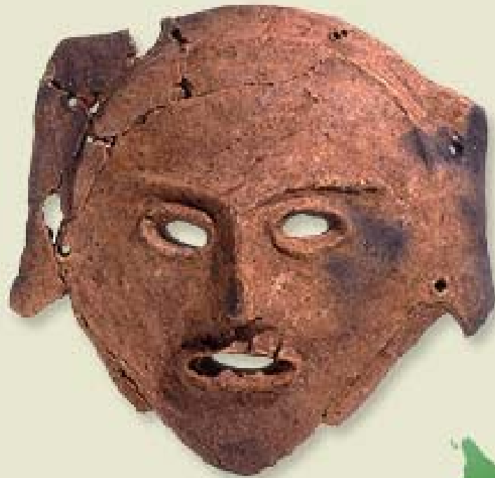
Chitose City's Mamachi Site

Clay Mask found on a grave (Chitose City's Mamachi Site)