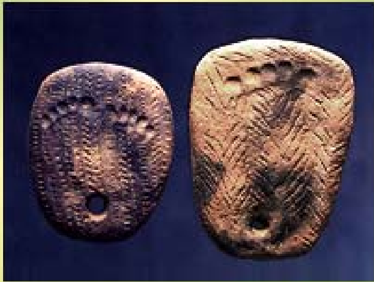
Clay tablets with impressions of feet – impressions made by pressing the clay with the soles of children's feet (Hakodate City's Kakinoshima Site)